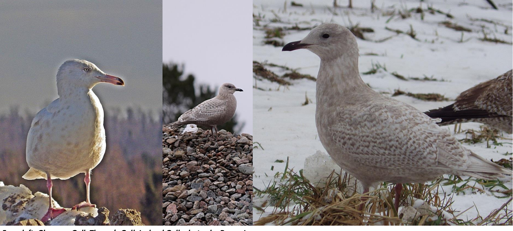
From left: Glaucous Gull, Thayer's Gull, Iceland Gull