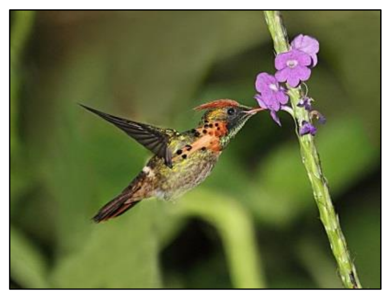
Male Tufted Coquette

to our area, the Ruby-throated Hummingbird. Hummingbirds rely on flowers for nectar so it is no wonder most stay put in South America.