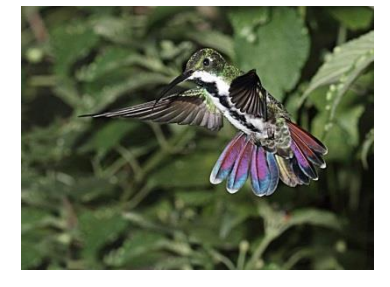
White Nnecked Jacobin, Blue Chinned Sapphire, female Black Throated Mango -- all hummingbird

Hummingbirds : Hummingbirds, tiny sunlit jewels that dazzle in the light like no other bird on earth, were seen by Bird Wing members in vivid colour during our showing of the PBS Nature Series documentary, Super Hummingbirds . There are 338 species of hummingbirds. They are only in the Americas and of those 338 species, only 17 species make it to North America and one