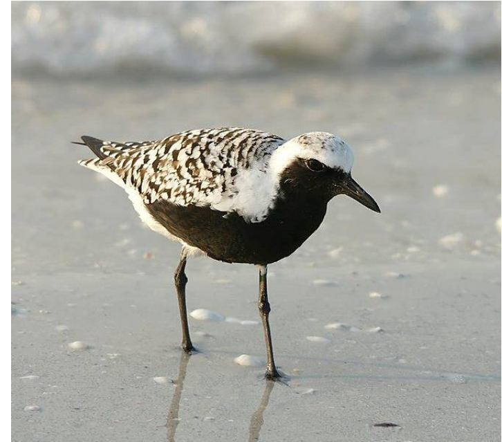
Hans Hillewaert, Wikipedia

The Black-bellied Plover, with its jet black face and neck surrounded by snow-white feathers, its jet black belly and checkerboard black and white upperparts, is quite an impressive plover, outstanding in the lagoon all by itself on its way to the high Arctic where it breeds. (See photo at right.) Not only is it a rather dazzling and fashionable plover, it is also the largest of the North American plovers. I haven't often seen one in the spring here. This may be the second time, the first being on Veuve River Road when a field there flooded in May 2019 and some of us saw many from May 22 to June 4. (It was a spectacular sight when, on May 27, about 200 of them took to flight!) We tend to see the Black-bellied more in the fall when they are not in their breeding plumage.