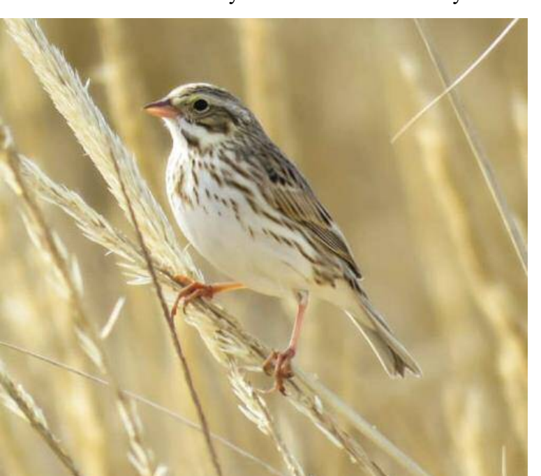
Savannahs, but both still have short, notched tails, small heads, fairly small and fine pink bills and yellow in the loral area, even if it is very limited and sometimes difficult to see with the naked eye.

During migration in Ontario, Lev reports that the Savannahs we most often see here are joined by those Savannahs that breed much further north, along the coasts of Hudson and James Bays and even further north. These Savannahs are larger and darker with less yellow showing in the lores. They can fool us because they look different from our smaller, lighter-coloured