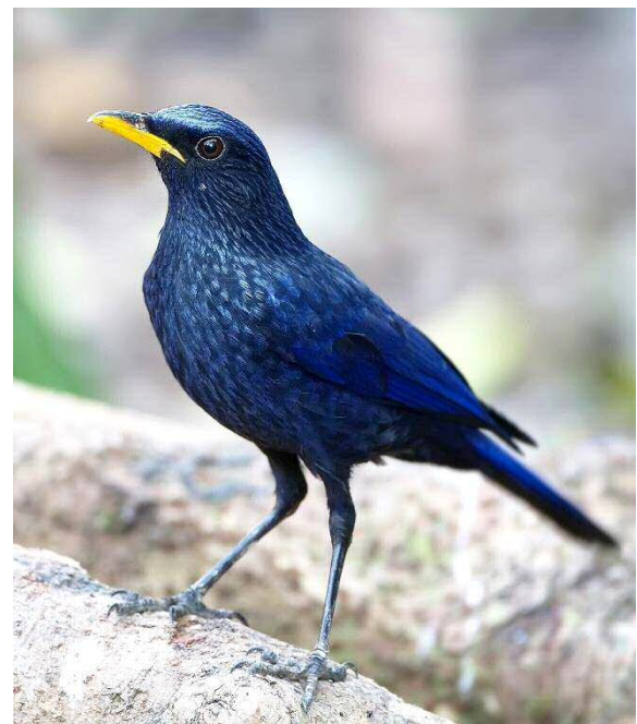
JJ Harrison, Wikipedia

It gets its name from its dark violet blue colour and for its loud whistling song, a long piercing note, sung at dawn and dusk. With its yellow bill in contrast with its dark blue body and the silvery spots found on its head, back and wings, it is what one might call a handsome bird. And although not a true thrush, it is found on the ground, turning over leaves and cocking its head.