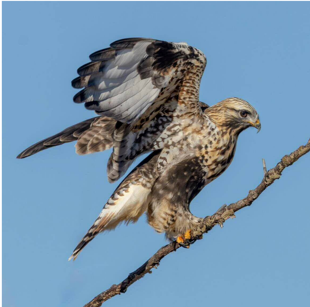
Rough-legged Hawk