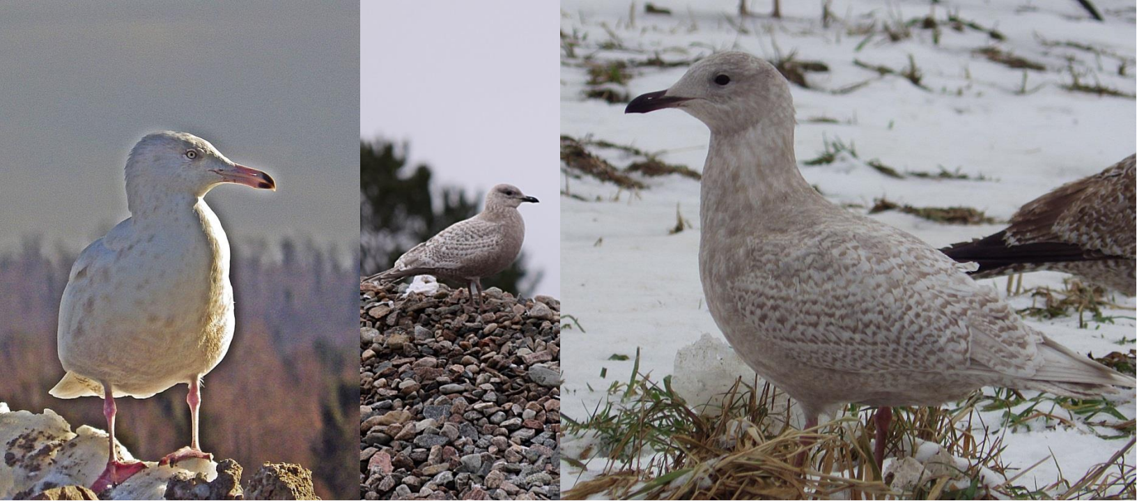
From left: Glaucous Gull, Thayer's Gull, Iceland Gull