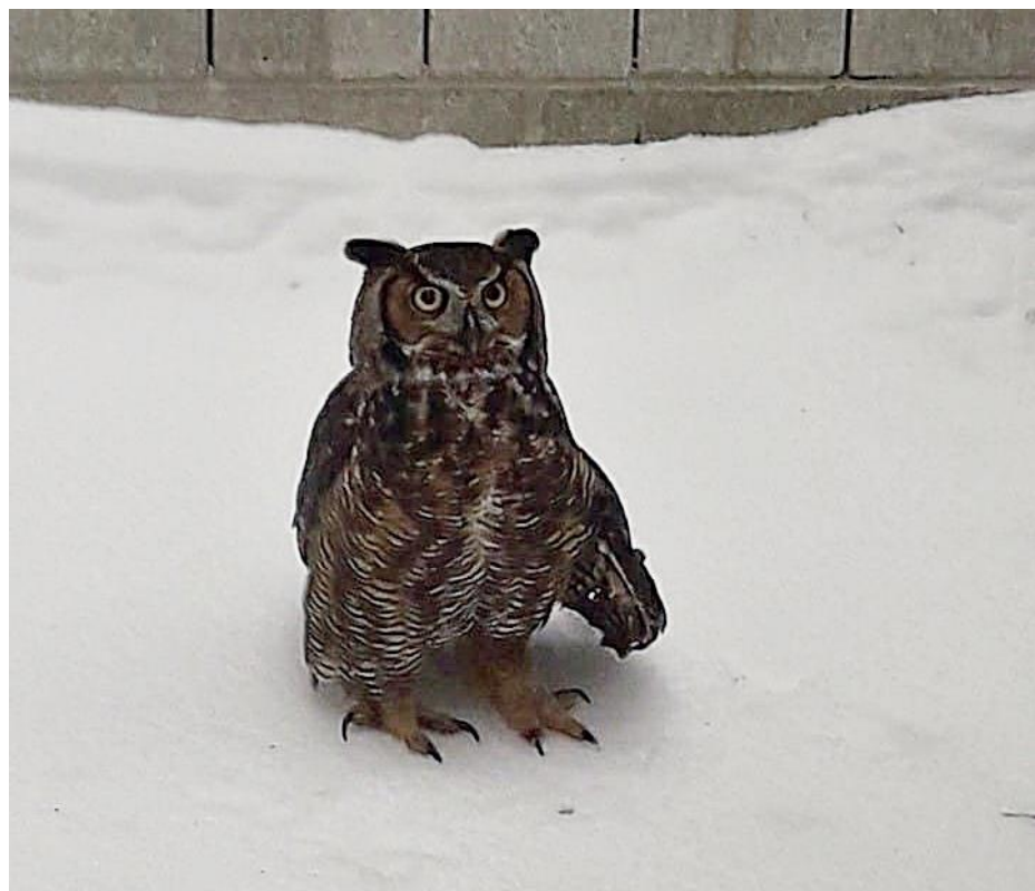
North Bay Hydro

The photo of the owl at right is from the North Bay Hydro Facebook page.